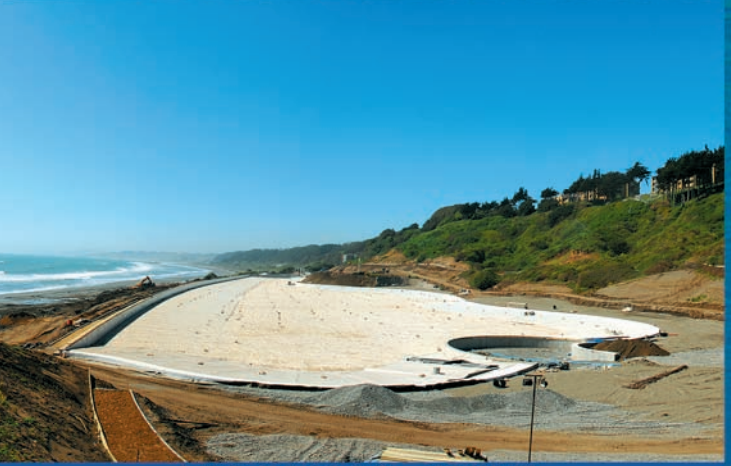
LAS BRISAS - CHILE