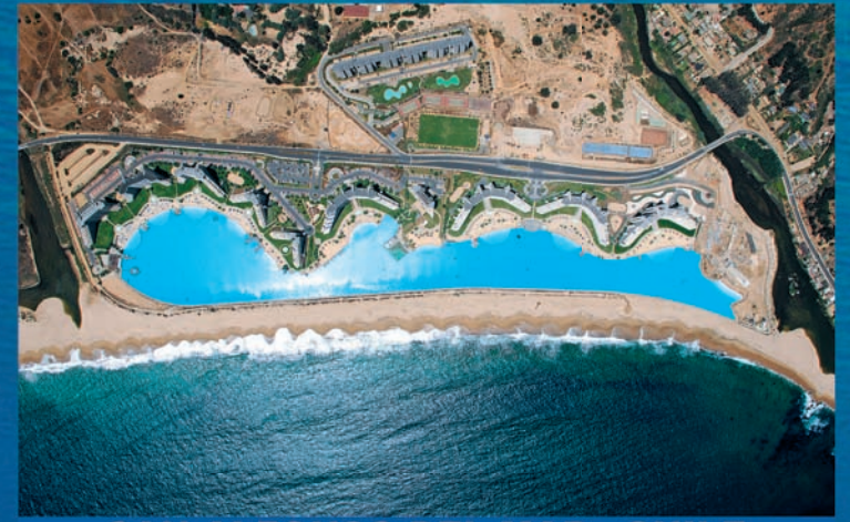
SAN ALFONSO DEL MAR - CHILE